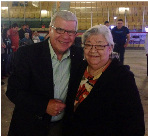
Unity Conference - Val D'Or, QC

July took us from Quebec to Manitoba as we saw the supernatural power of God at work, and carried the Stand On Guard message wherever we went. In Val d'Or we were privileged to minister at a trilingual Unity Conference (English, French and Cree). It's so amazing to see all three cultures, languages and the varying generations bound together as one in the Spirit, worshipping Jesus, and letting Him ignite them with His fire.