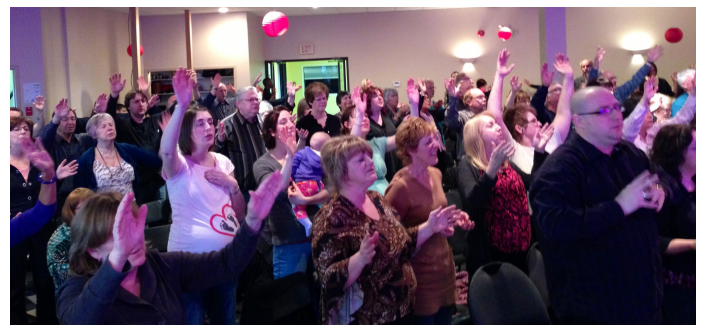
Believers worship in the Maritimes